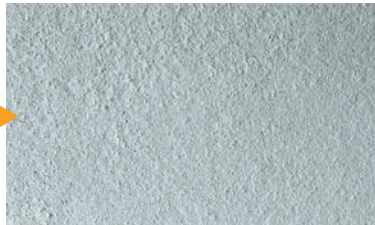
Base coat/bridging of the existing coating with KEIM Contact-Plus