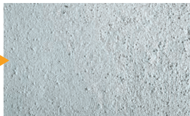
Base coat/crack-filling with KEIM Contact-Plus-Grob