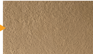
Intermediate or top coat with KEIM Granital