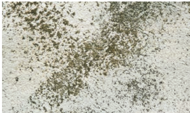
Weathered dispersion paint