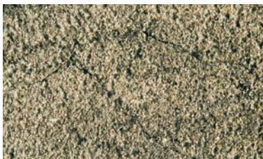
Existing render with cracks