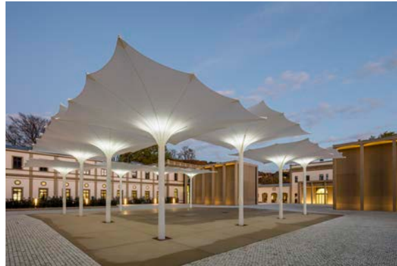
The fair-faced concrete supplementary structures in the courtyard blend perfectly with the historical building complex.

There is still something quite special about the historical rooms of the Luitpoldbad bathhouse in Bad Kissingen, Lower Franconia, where kings and emperors used to come and take the waters. Despite being left empty for decades and even after comprehensive refurbishment, many historical parts of the building complex that exude a particular atmosphere have been preserved. The work was carried out hand-in-hand with the monument preservation authority and prevented the building from falling into disrepair. Today it is used as office space for the city authorities.